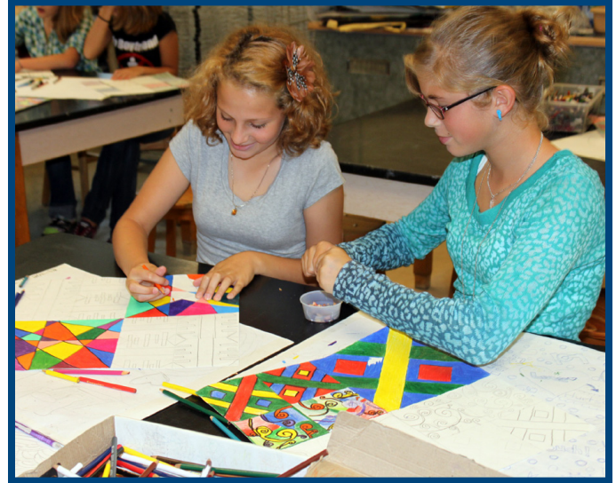
Seventh-grade students in Ms. Quackenbush's art class create tile designs as part of their study of design elements, color theory and composition.

For the latest information on everything happening at Broadalbin-Perth, visit our district Web site: