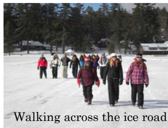
Walking across the ice road