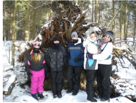
My time at Raquette Lake was amazing. The food was delicious! We did so many fun and interesting activities.

I like how we got to learn about one another.