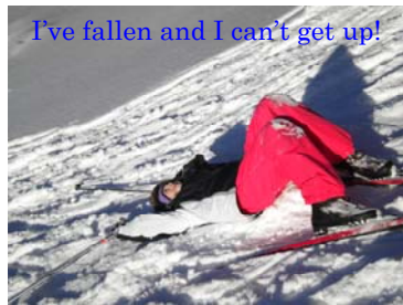
I've fallen and I can't get up!

This trip was an amazing experience for me and it really showed me that some things in life, like electronics, aren't always necessary.