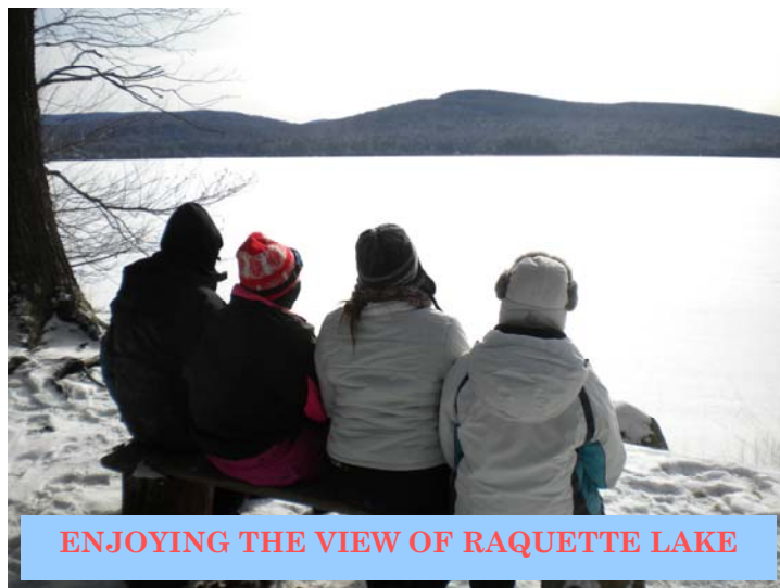
ENJOYING THE VIEW OF RAQUETTE LAKE

As the weekend draws to an end, the students write "Raquette Lake Reflections" about their field trip experiences. Excerpts from their reflections can be found in the pages that follow.