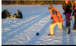
A broomball breakaway

I am so glad I joined Project Adventure. This experience has been so amazing. There was pain, there was fun, there were fears, and there were tears. I have never felt so close to all my friends. Not to mention I made a lot of new friends. I honestly can't explain how much I enjoyed these three days, although my legs and feet hurt like crazy from the hike to Camp Kirby and the walk across the ice road.