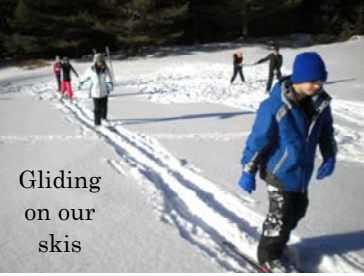
Gliding on our skis

I liked learning new things about myself, I made new friends, and attempted to conquer my fears.