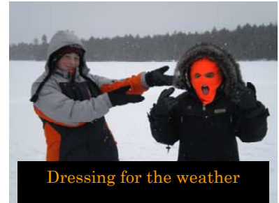
Dressing for the weather

Cross-country skiing was fun, but I realize I'm more of a snowboarder.